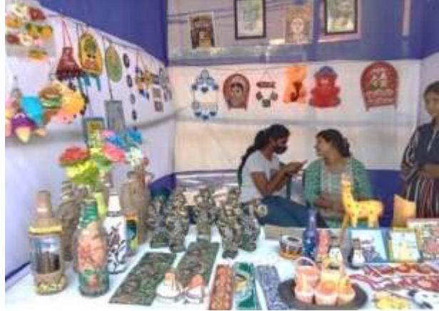
Student-made wonders shine at Creative Sattva Fair organized by EDC