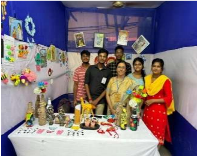
Crafted with care, admired by everyone!