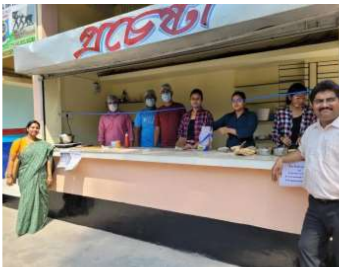
The inauguration of 'প্রচেষ্টা,' EDC's permanent stall, offering a platform for our college students to showcase their creativity.