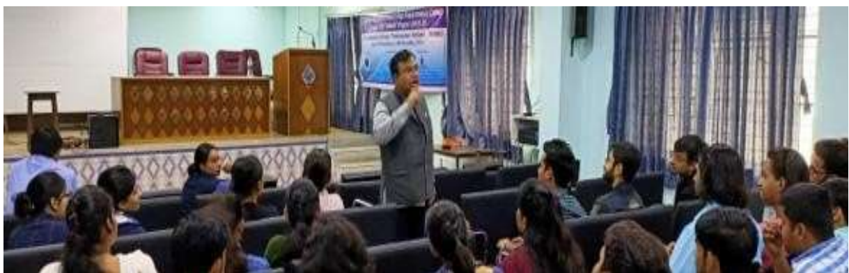
Inauguration of the EDC Workshop in 2019