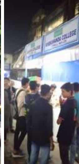
Students' enthusiasm and involvement surpassed all expectations.