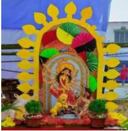
Devi Durga's Idol made by a young student of our college.