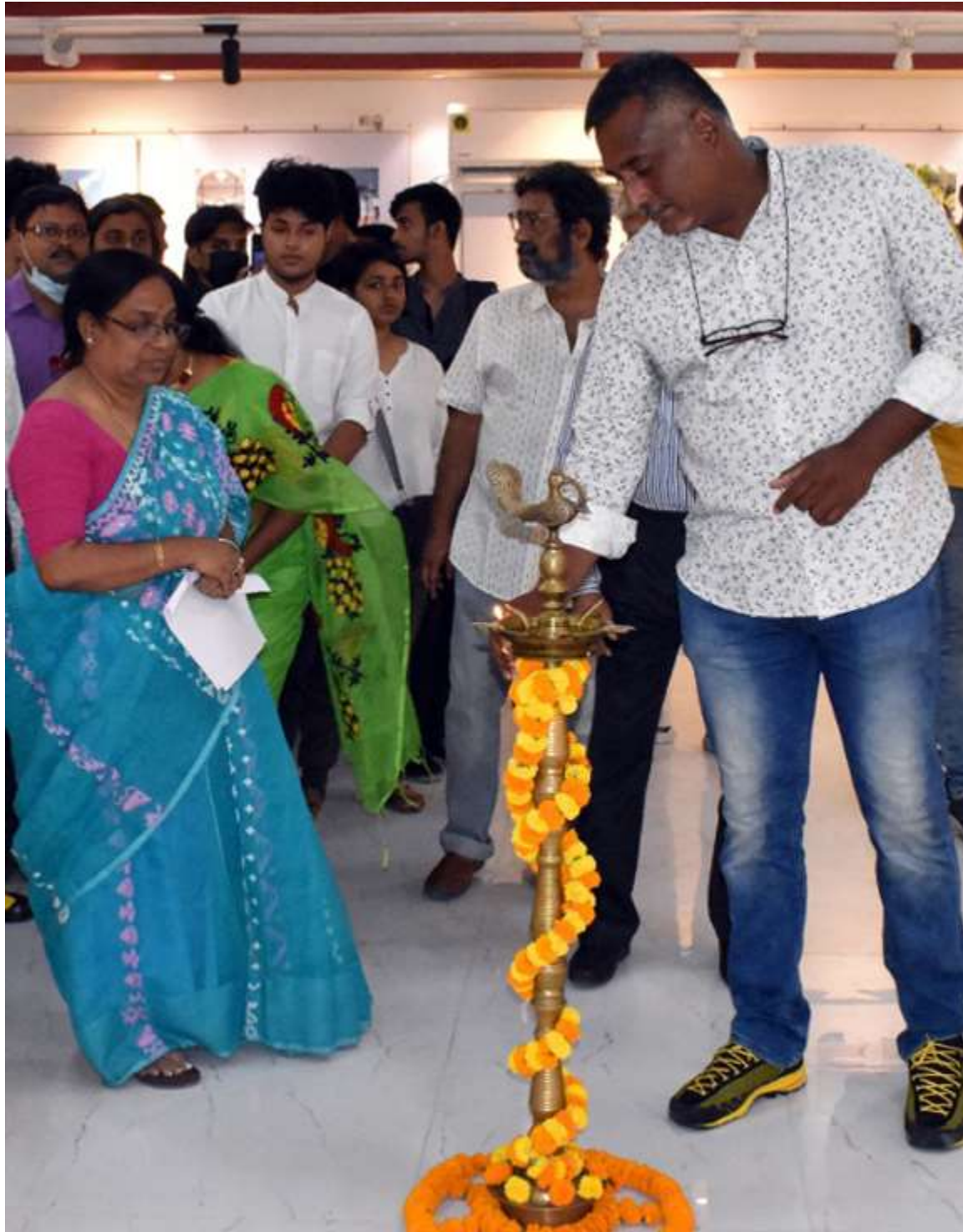
Internationally Famous photographer Mr. Dritiman Mukherjee is lighting the lamp at the inauguration of Photography exhibition.